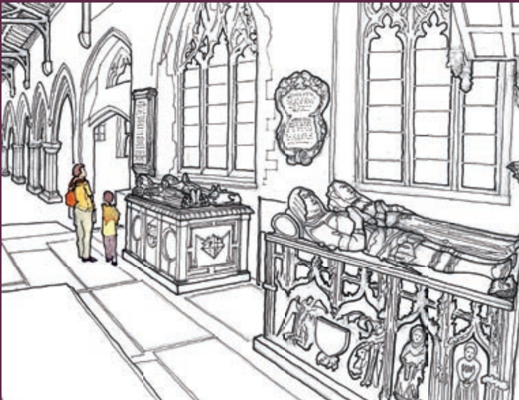
▲ Artist impression of the monuments viewed towards the north-west Artist impression of the monuments looking east ▶