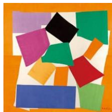
The Snail, Matisse 1953

French artist Henri Matisse was prevented from painting in 1948 due to ill health but, although he was confined to bed, he produced a number of pictures known as gouaches découpées . These were made by cutting or tearing shapes from paper which had been painted. Matisse had to adapt his art style when he became ill to suit his situation.